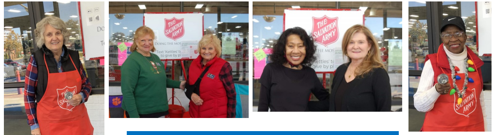
#HopeMarchesOn Salvation Army Bell Ringing