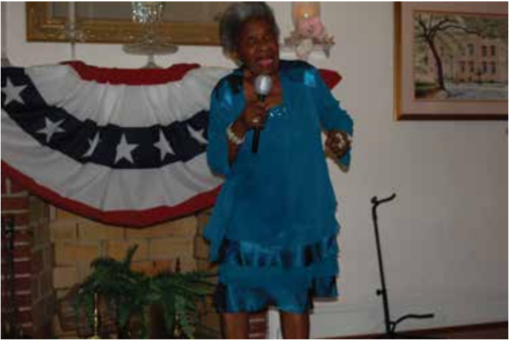
The lovely Tina Turner (Anna) "Rolling down the river"