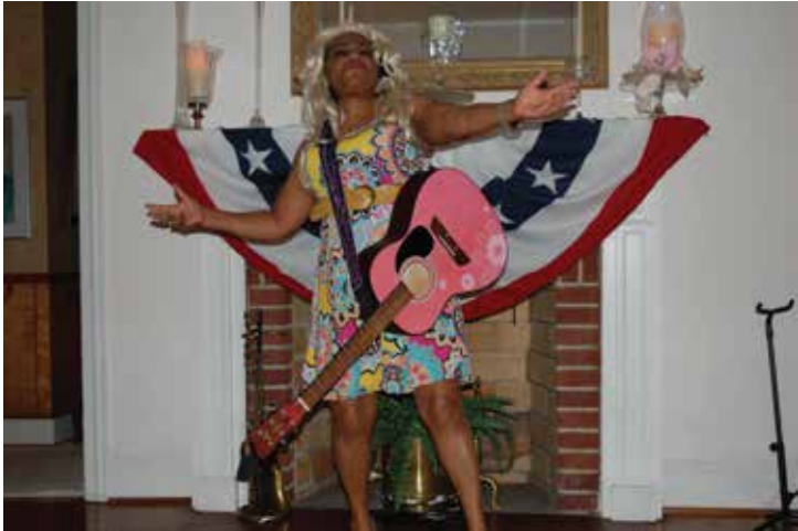
Dolly Parton (Belita) finale