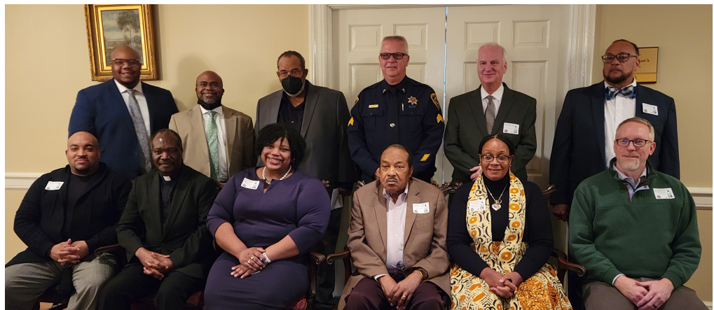
Our honored guests at this year's Clergy Appreciation Day, February 7.